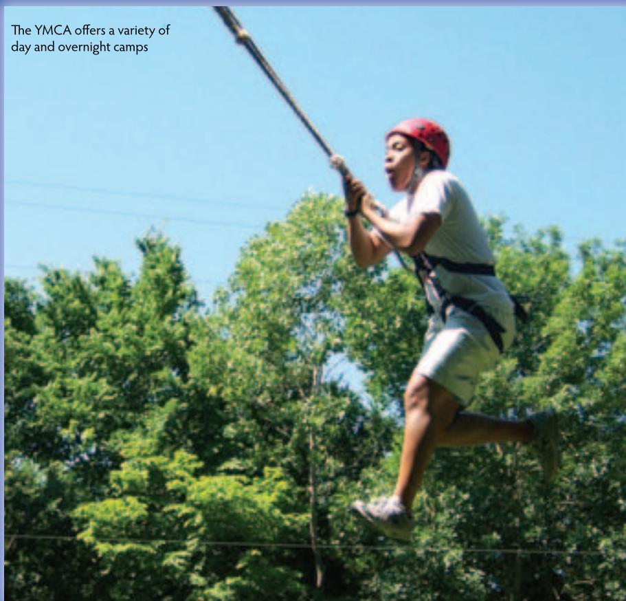
The YMCA offers a variety of day and overnight camps

Half-day weekly summer camps for children ages 3 to 8 years. Weekly parent/child classes for infants and toddlers and dance, gymnastics, karate, and sports skills classes for 3 to 12 year olds.